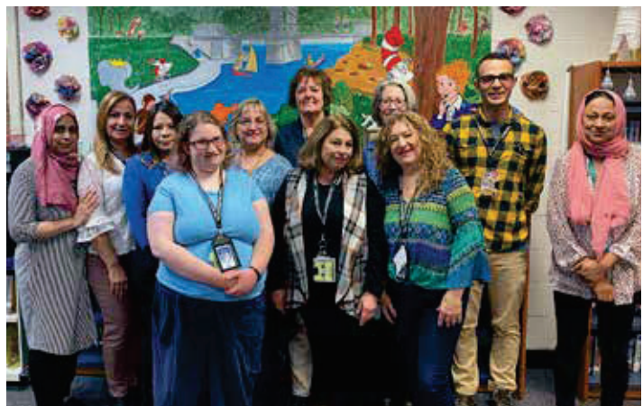
Paraprofessionals support teachers and students at Meyer School (at top) and Middleton School (above).